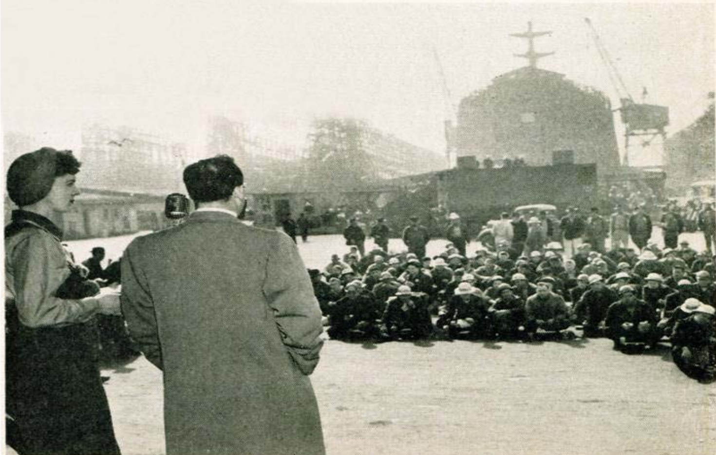
Noon-hour loudspeaker health education program in Kaiser Shipyard, Richmond. Staff physician talking on the common cold

"To improve the health of our members and the communities we serve"